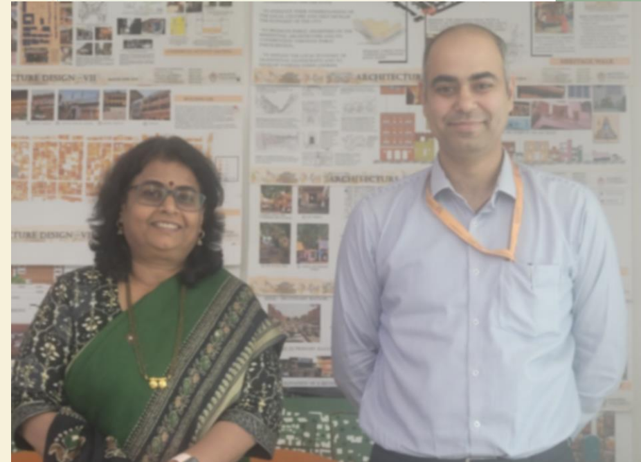
(left) Associate Dean (I/C), School of Architecture & Design