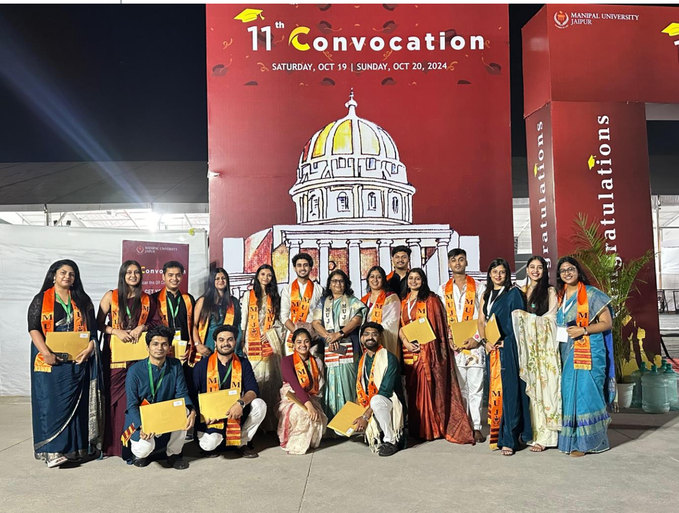
Graduating Batch of 2019-24